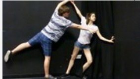
Idle Motion theatre workshop

Love Bites is a brand new juke-box musical devised by the College Performing Arts Company, ClassAction and based on the novel and film "Let The Right One In" by John Ajvide Lindqvist.